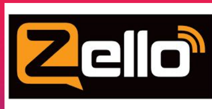
Two way apps