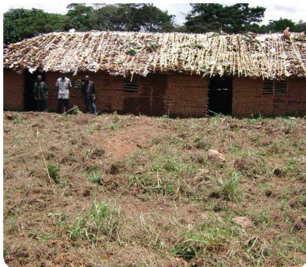
The Boyo secondary school building, located within the Anglican Diocese of Boga, Democratic Republic of Congo (DRC), is in need of reconstruction. The school, along with many others, was destroyed during regional conflict.

New Secondary School Building Equips Students and War-torn Communities