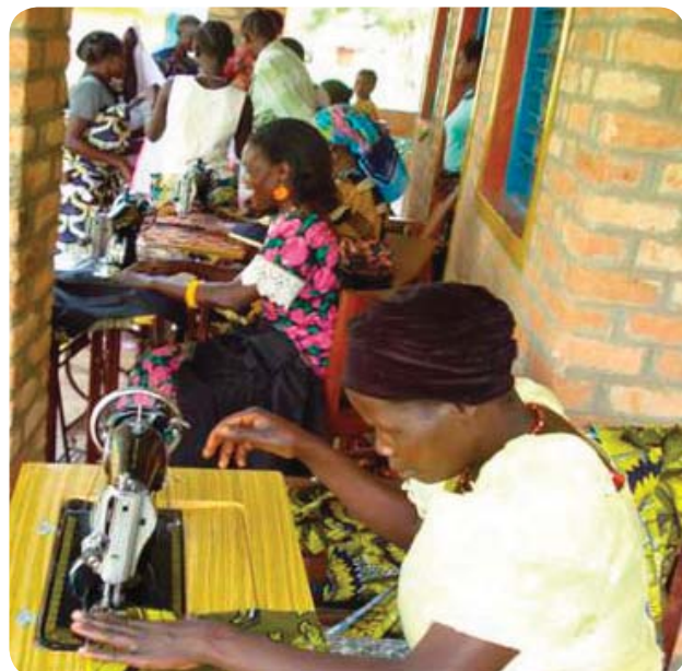
Dressmaking skills were taught as part of a 2009 women's empowerment class in Yofenyiri, Democratic Republic of Congo. The classes were offered by the Anglican Diocese of Aru.

Vocational Skills Offer a Way Out of Poverty and Encourage Reconciliation