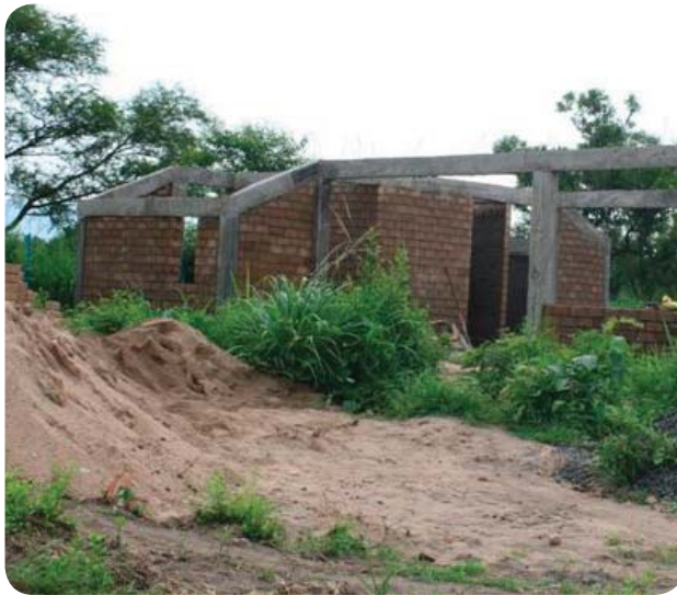
A guest house under construction at the Gambella Center for Mission in Gambella, Ethiopia, is part of a three-year construction on a mission center that will serve the community in multiple ways. A library to serve school children is included in the first phase of construction.