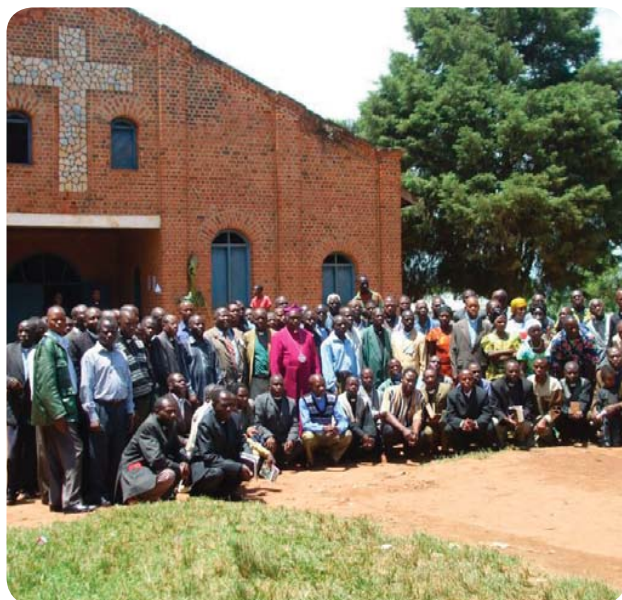
St. Andrew's Cathedral was the site of a training class on peace and reconciliation that was led by the Anglican Diocese of North Kivu. The training was held following large-scale conflict in the area.

Conference Center Enables Diocese to Expand Holistic Ministry